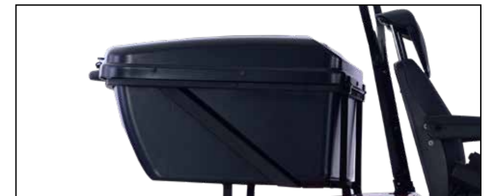
Thermoplastic Cargo Box