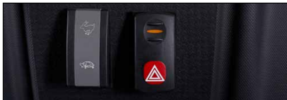
Speed and Torque Mode