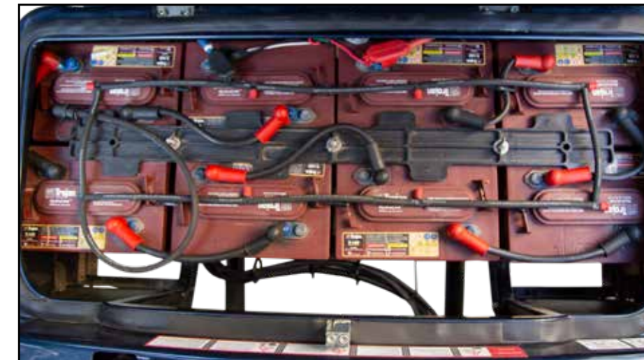
Automatic Battery Watering System