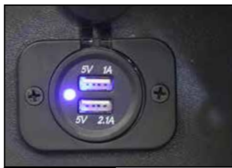
USB 12V Input