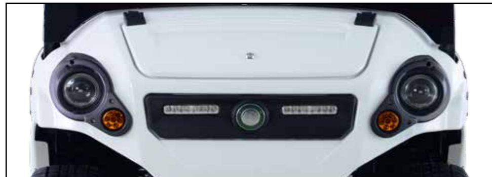
Halogen Driving Lights