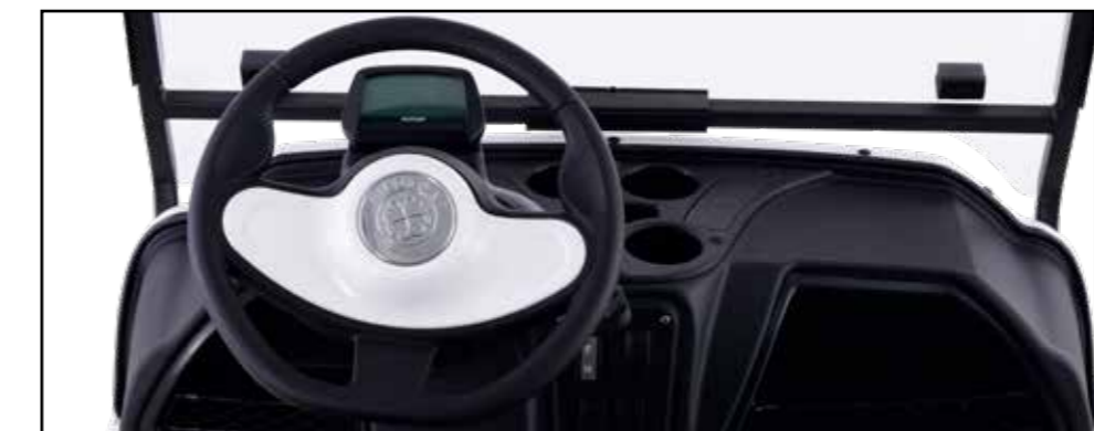
Sport Steering Wheel