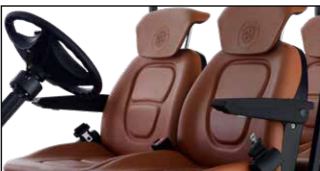
Premium Seat - Tobacco Colored