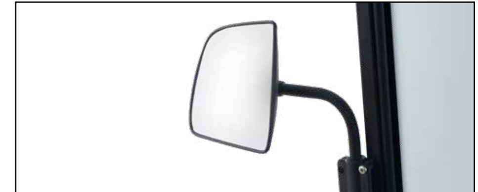
Side View Mirrors