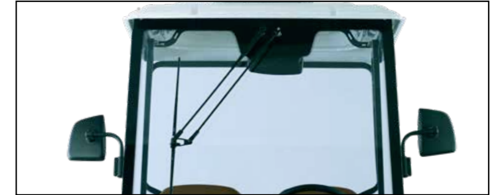
Security Glass Windshield