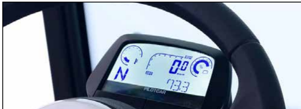
Digital Vehicle-Info Screen