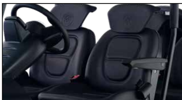
Premium Seat - Carbon Black