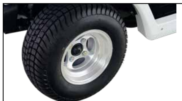
On-road Tyres & 10" Aluminum Wheels