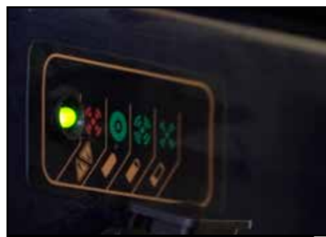
Charger with External Display