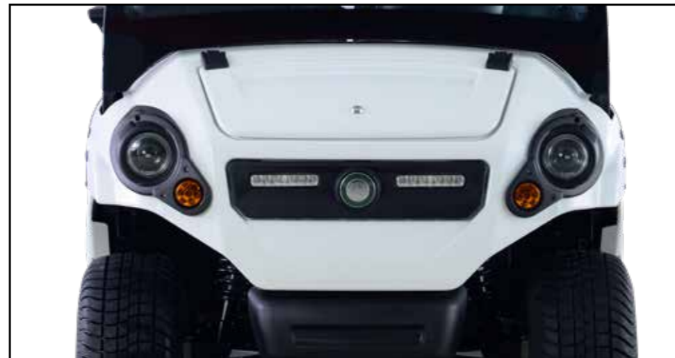
LED Driving Lights